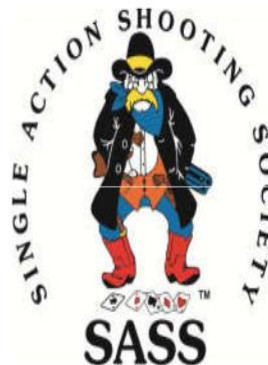
2020 Black Powder State Championship