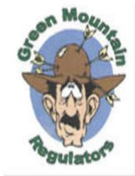
2020 Regulators Revenge